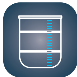
8 litres storage