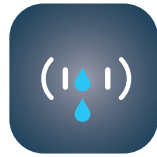
Double layered RO+UV protection