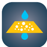
Copper impregnated activated carbon