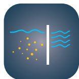
Super fine sediment removal