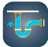
Hydrostatic pressurized dispensing