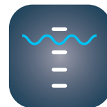
High purification capacity