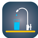
Elegant SS goose-neck faucet