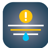
UV fail alert