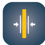
Compact & Stylish