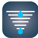
6 stage purification