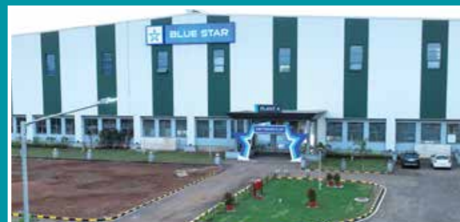
Wada – Deep Freezer Plant