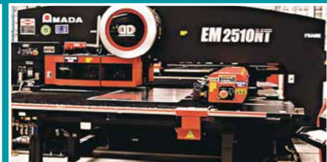
Panel Punching Machine