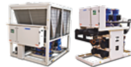
Air Cooled and Water Cooled Scroll Chiller