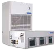
Packaged ACs & Ducted Splits