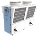
Inverter scroll chillers