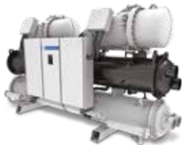
Water-Cooled Screw Chillers Configured Series