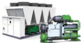
Air cooled & Water cooled VFD Screw Chillers