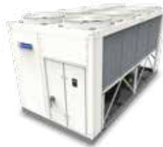
Air-Cooled Configured Screw Chiller - High Efficiency Series