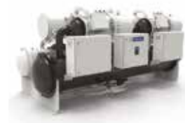
Water Cooled Falling Film Screw Chillers