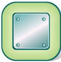
Plate-type heat exchanger with water storage tank

Generally, the heat load in process applications fluctuates heavily. A load balancing system is therefore implemented in Blue Star Process Chillers to ensure the supply of constant temperature, leaving water at both high and low loads. While the water storage tank takes care of sudden demand for high heat load, the load balancing valve takes care of low loads. This unique combination supplies chilled water to the process at a fairly constant temperature.