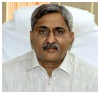
Press Trust of India Ranchi

CIL to invest ₹91,000 cr for diversification, says CMD Prasad