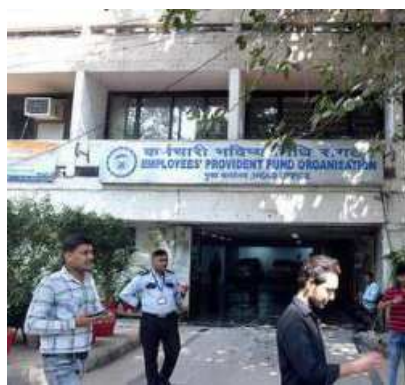
KR Srivats New Delhi

Higher pension under EPS: Additional 1.16% contribution to be drawn from employers' payout